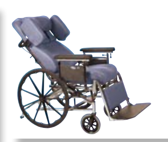
HTR 5500 Tilt and Recline Chair in full tilt position